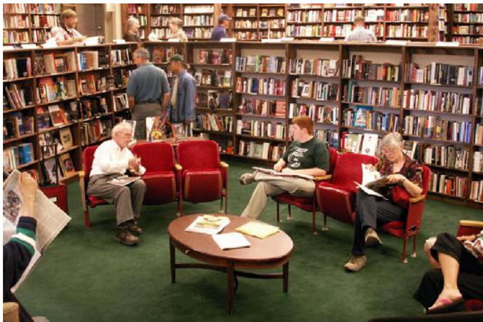
Tattered Cover on Colfax Avenue, http://www.tatteredcover.com/

Blog ( http://portersquarebooksblog.blogspot.com/ )