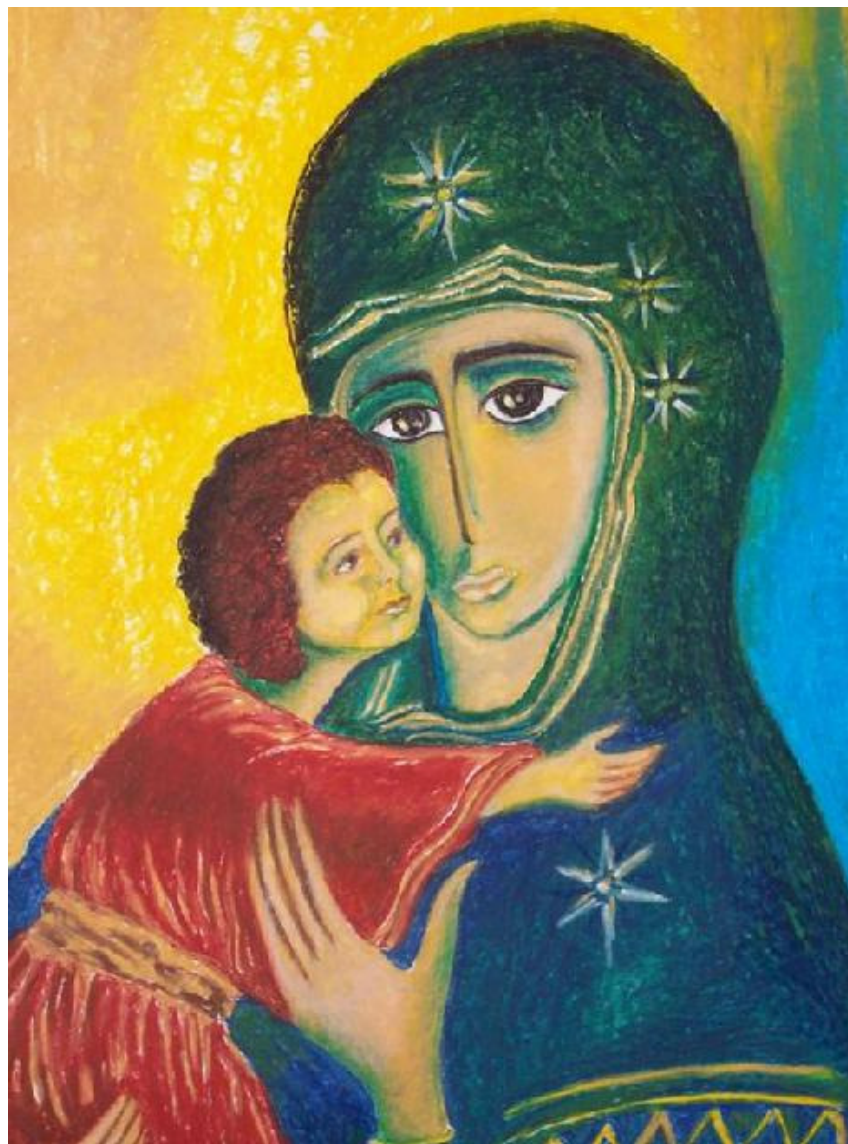
"Icon Lady" by Hermes Hernandez; http://www.myspace.com/hermeshart/photos/10475863#%7B%22ImageId%22%3A285472%7D

From the Editorial Staff at The Write Place At the Write Time: