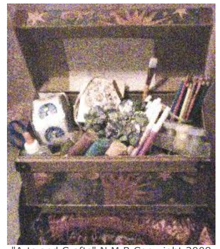
"Arts and Crafts" N.M.B Copyright 2008

What a Writers' Craft Box is: Say you're doing an art project and you want to spice it up a bit. You reach into a seemingly bottomless box full of colorful art/craft supplies and choose only the things that speak to you. You take only what you need to feel that you've fully expressed yourself. Then, you go about doing your individual project adding just the right amount of everything you've chosen until you reach a product that suits you completely. So, this is on that concept. Reach in, find the things that inspire you, use the tools