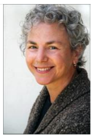
Author/Poet Ellen Bass; Photo