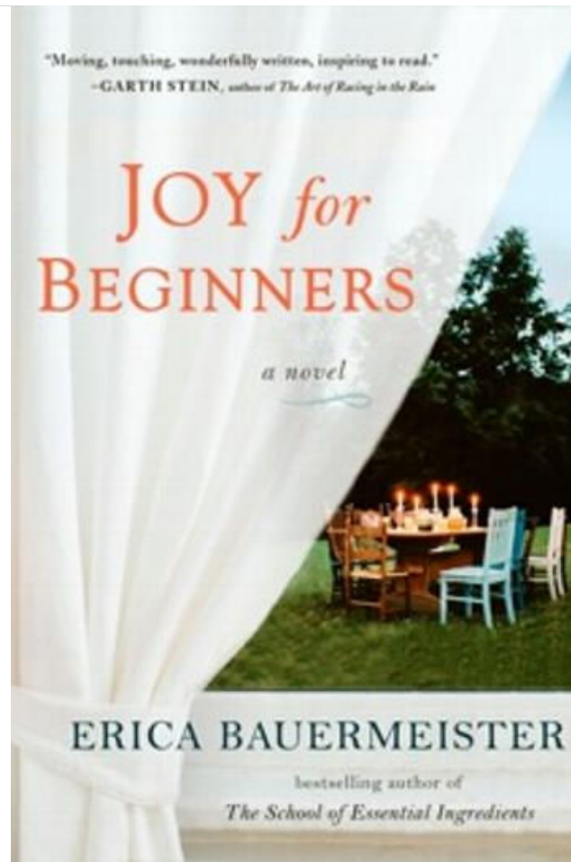
Cover Image of Joy for Beginners by Erica Bauermeister