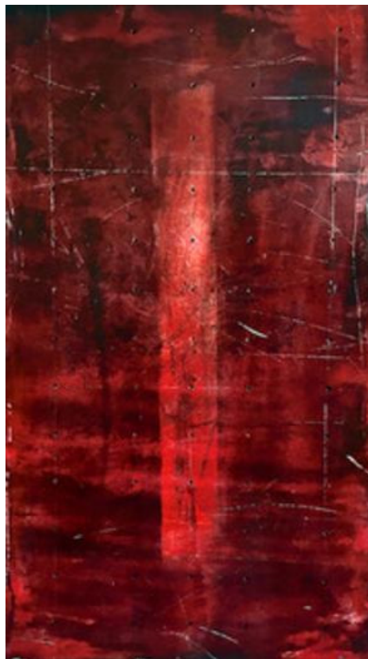
"Passion's Shield" by Ken Steinkamp; http://kensteinkamp.com/

About this image: " Passion's Shield , with its deep red colors, layered enigmatic shapes, exposed metal edges and gouged lines, presents the viewer with an enigmatic image to ponder, those life forces that shadow, impact, and define our being." —Ken Steinkamp