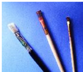
"Artsy"