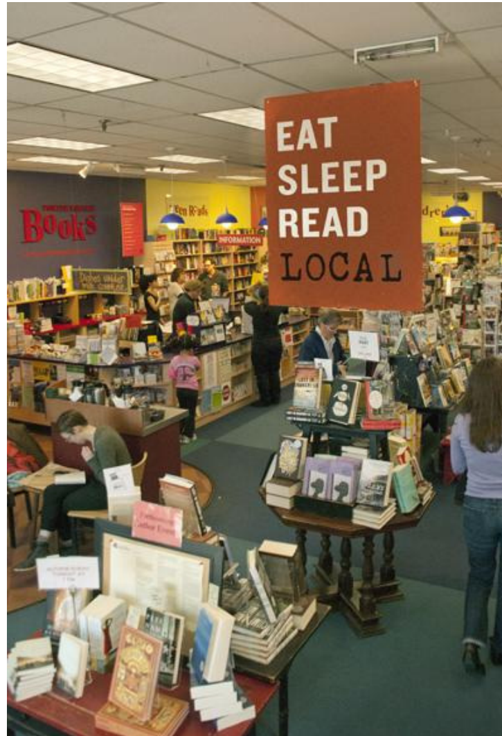
Porter Square Books; http://www.portersquarebooks.com/

http://www.usatoday.com/life/books/news/2011-02-10-1Abookstores10 CV N.htm