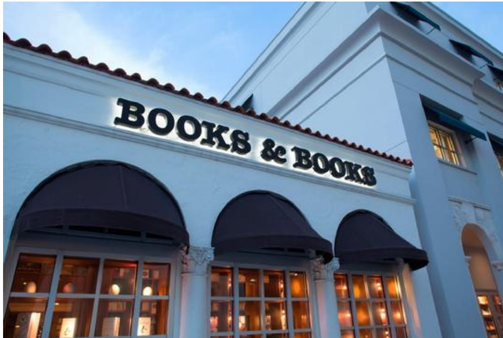
Books & Books; http://www.booksandbooks.com/

Books & Books is a renowned independent, locally owned bookstore with three locations in South Florida – Coral Gables, Miami Beach, and Bal Harbour Shops -- plus stores in Grand Cayman, Miami International Airport, Westhampton Beach and the Museum of Art Fort Lauderdale.