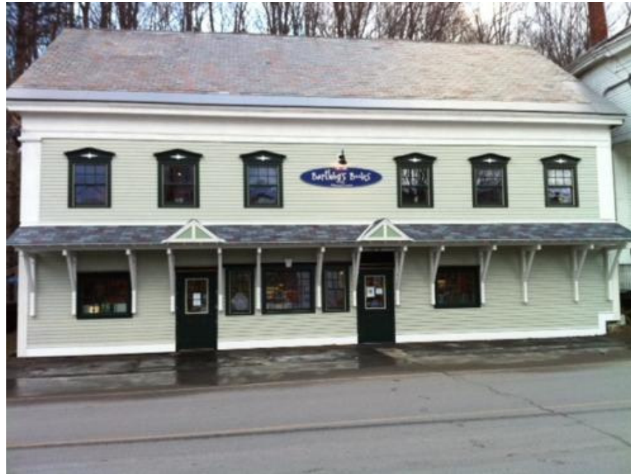
Bartleby's Books; http://www.bookcellarvt.com/

Bartleby's Books turned 22 this year and is located in the resort community of Wilmington, VT. The town has a sizable second home owner population which creates a heightened and diverse audience for author events particularly in winter and summer months. Bartleby's is situated in the center of downtown in a three-story building which we have worked to