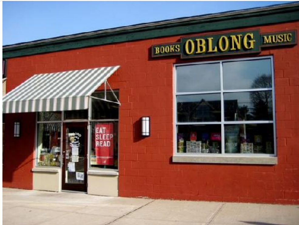
Oblong Bookstore Image; www.oblongbooks.com

Oblong Books & Music - Millerton & Rhinebeck, NY - http://www.oblongbooks.com