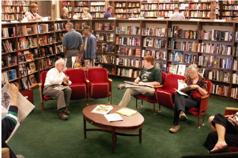
Tattered Cover on Colfax Avenue, http://www.tatteredcover.com/

Blog ( http://portersquarebooksblog.blogspot.com/ )