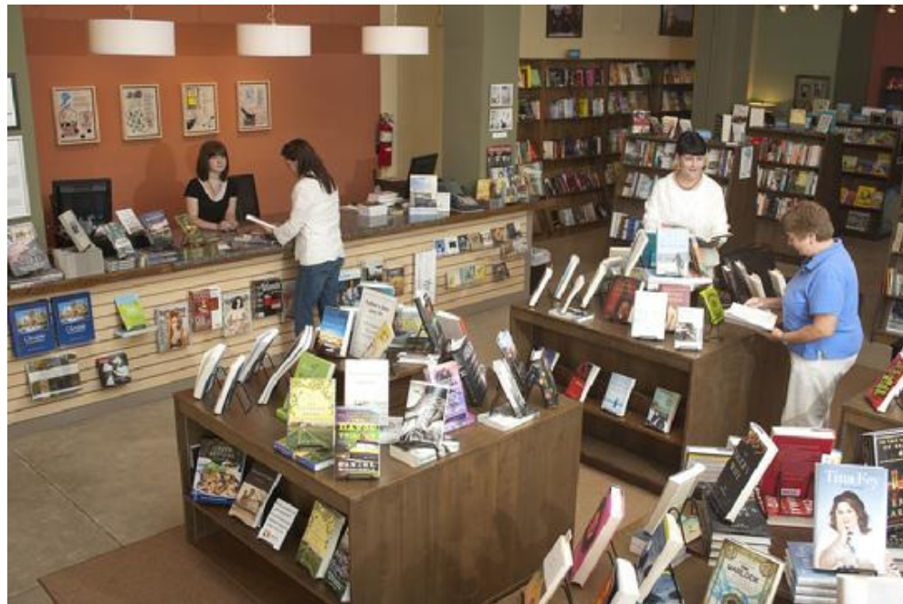
Hub City Bookshop; http://www.hubcity.org/bookshop/