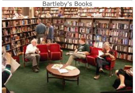
Tattered Cover Book Store

"The role of Bank Square Books in the community at large is huge and vitally important. We work hard and creatively to provide unique and diverse event programming both in our store and throughout our coastal area. We host instore author events that are formatted as a discussion, hold fundraisers often tied to related non-profit organizations and host intimate, exclusive author dinners and luncheons for authors looking to build an audience in Southern New England."