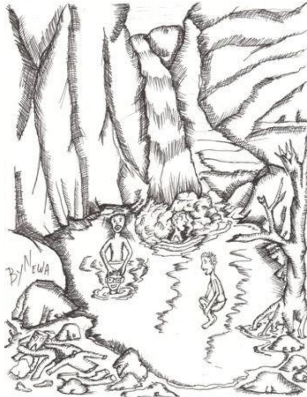
"First Falls" by Newa; Copyright 2009