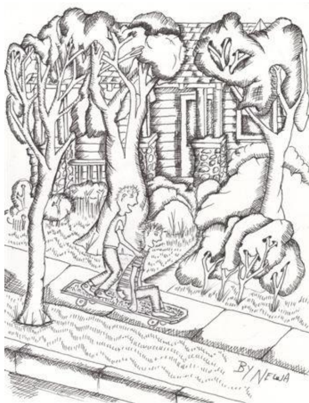
"Inventing the Skateboard" by Nawa; Copyright 2009