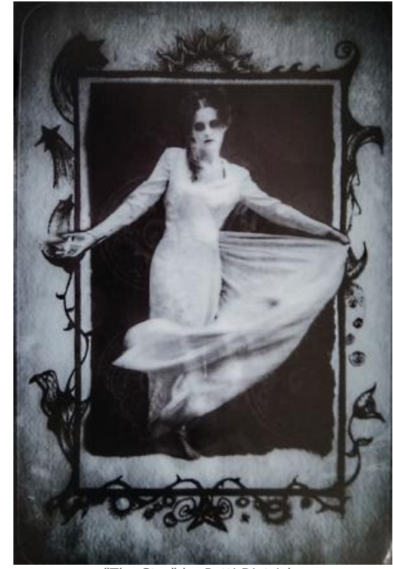
"The Star" by Patti Dietrick; https://www.flickr.com/photos/pattidietrick/